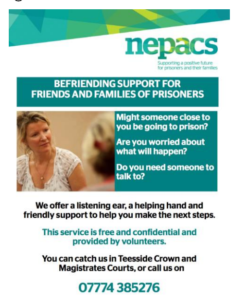
Figure 1: Information available to families

reminded to give any keys to the house or car; and told to write down names of any medication they are receiving. When they come out of court without their loved one, families need answers to their many questions, such as, what will happen now, where will he go, when can I see him, how can I send him things? The project workers and volunteers answer these questions, giving them piece of mind, and explain about their befriending.